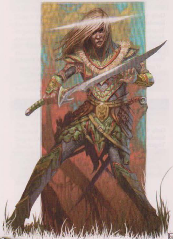
CHAPTER 2 | Character Classes

Whenever you attack with your ardent powers, a silver corona glimmers around you. Those it touches feel their confidence building, the pain from their injuries falling away so that they can keep fighting no matter the odds.