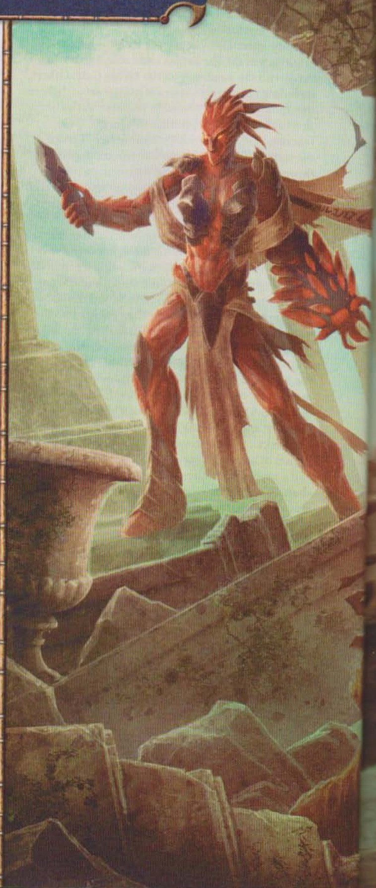
JASON A. ENGLE

Wilden are plantlike fey creatures, newly arisen in the Feywild to combat the spread of the Far Realm's influence. They can take on different aspects of nature's essence, altering their appearance and even their personality with each change of aspect.